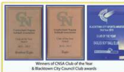
Winners of CUSA Club of the Year & Blacktown City Council Club awards

Eagles is an award winning club with a family friendly culture. We are community minded and enjoy taking part in charity days and are also proud to be a Level 3 Good Sports Club. So come down and become part of the Eagles family.