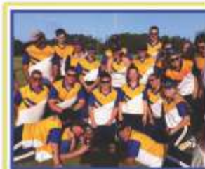
Winners! Mixed Division 2