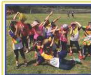
Colour Me Happy Day supporting The Children's Hospital, Adolescent Medicine Unit